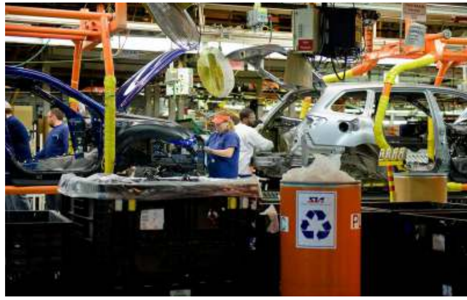
Automaking materials, such as metals and plastics, are in abundance at SIA, but the manufacturer makes it a priority to reuse and recycle the materials.

Some industries and organizations can use their visibility in the community to promote environmental stewardship beyond their own locations or factories. Two such examples are the Alcoa Foundation, which awards grant money for environmental causes in the community such as tree planting; and