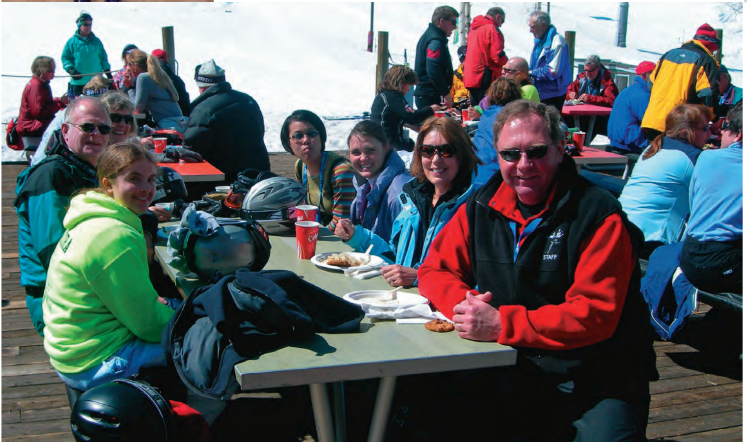
Lafayette Ski Club members enjoy lunch on the mountain at Snowmass, Colo.

"Most of the members of the group that you race with will give you hints and tips," he says. "You can be competitive against yourself, and try to beat your own time and improve your technique."